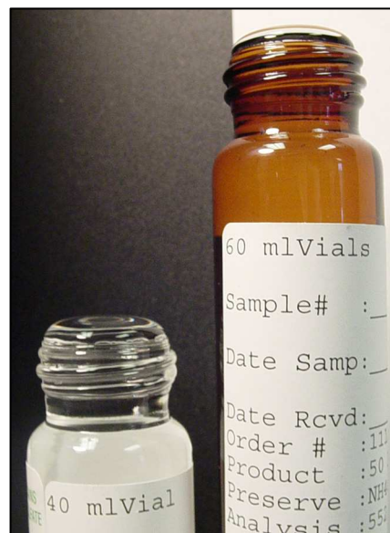
Example of "small button of water"